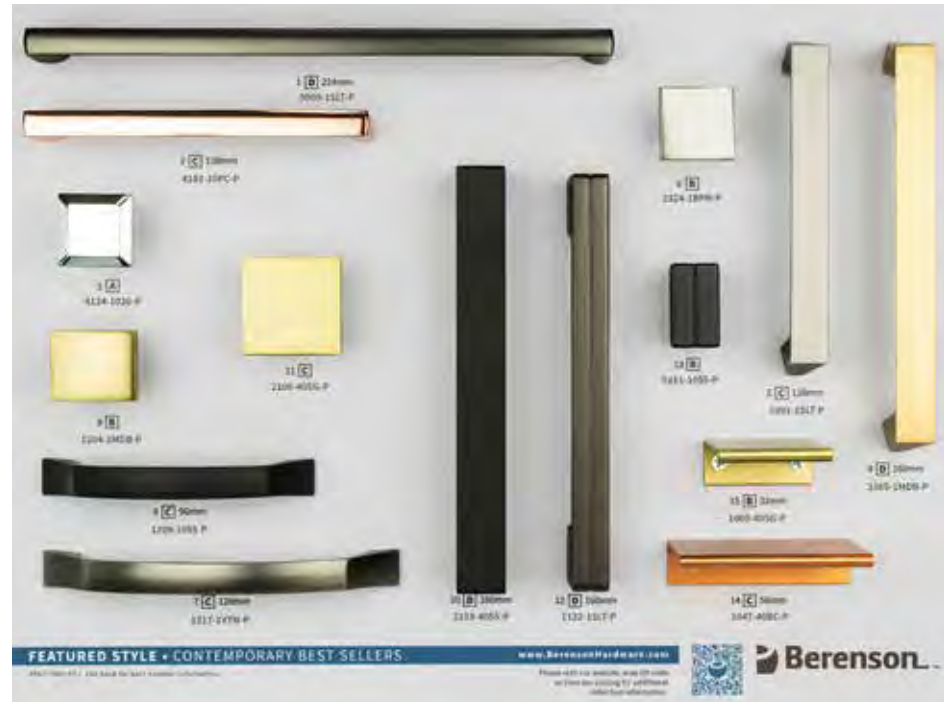
CONTEMPORARY BEST SELLERS

Now available are four new featured boards. Three boards display best-selling Berenson collections, and one finish selection board. These can be helpful for smaller showrooms that would like to show our products but do not have the space for a larger tower. These show best sellers from each of our Berenson Series'. The Finish Selection board is a great tool to help show the difference between our finishes.