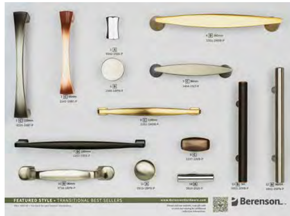
TRANSITIONAL BEST SELLERS