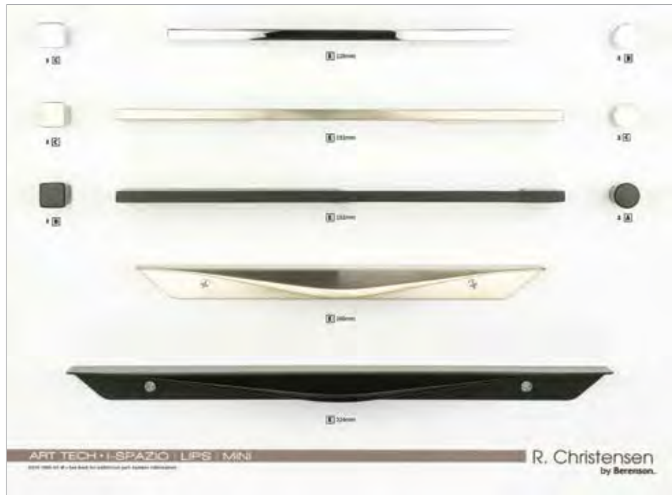
I-SPAZIO | LIPS | MINI