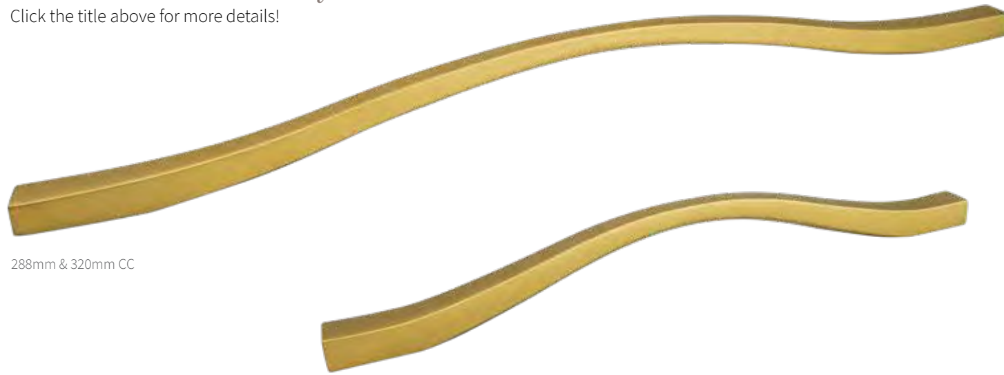
288mm & 320mm CC