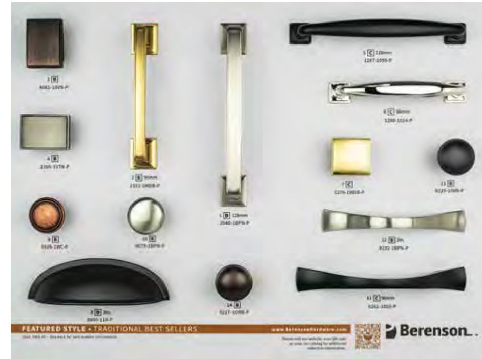
TRADITIONAL BEST SELLERS