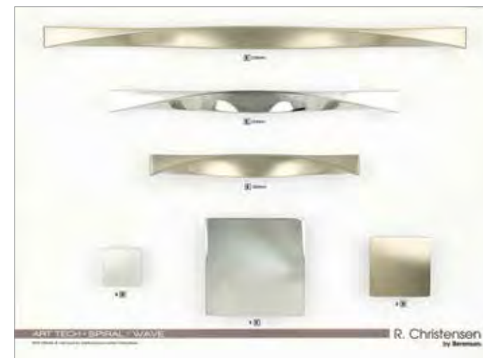
SPIRAL | WAVE