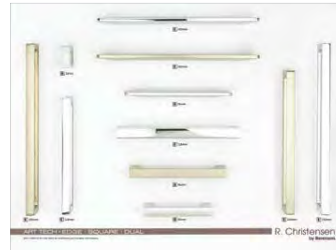
EDGE | SQUARE | DUAL