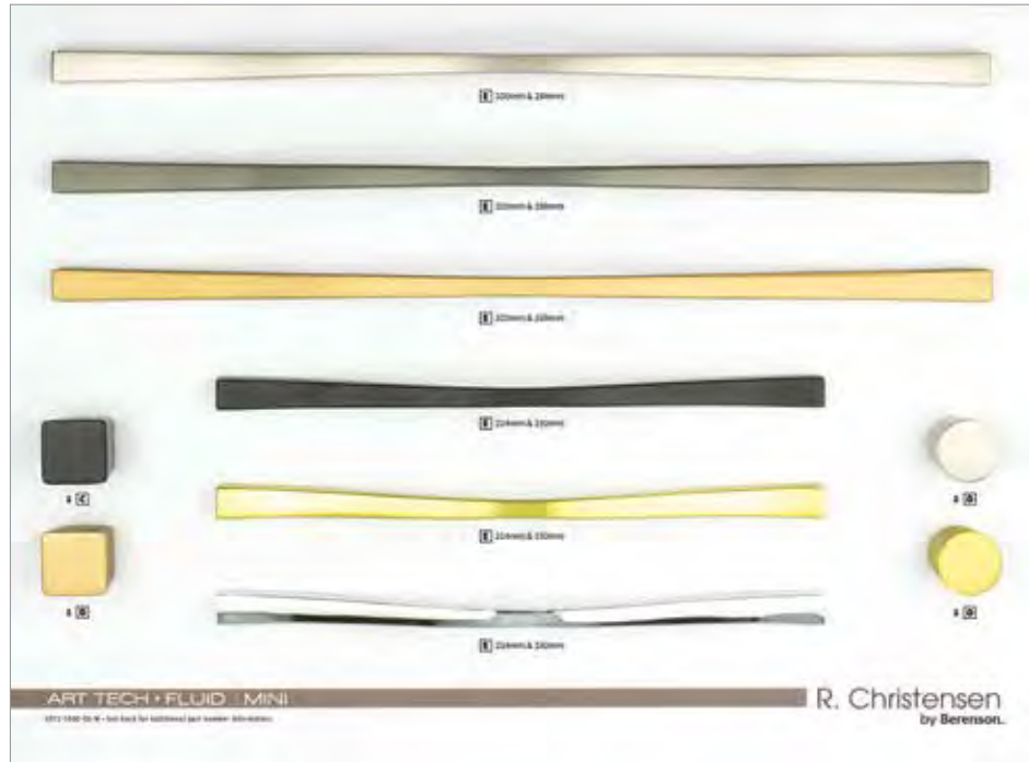
FLUID | MINI

The display boards of R. Christensen by Berenson have been updated with new layouts and collections regrouped. These five new boards feature recently added finishes as well as the new collections of Fluid and Mini. Three display boards have been left unchanged and are still available.